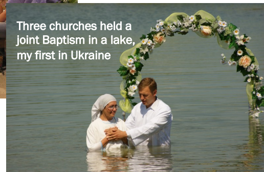
Three churches held a joint baptism in a lake, my first in Ukraine