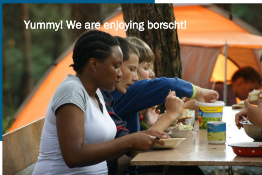
Yummy! We are enjoying borscht!